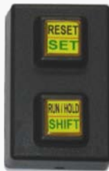
Switch Box Controller