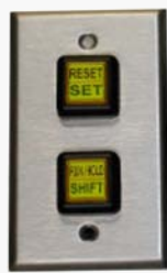
Wall Plate Controller